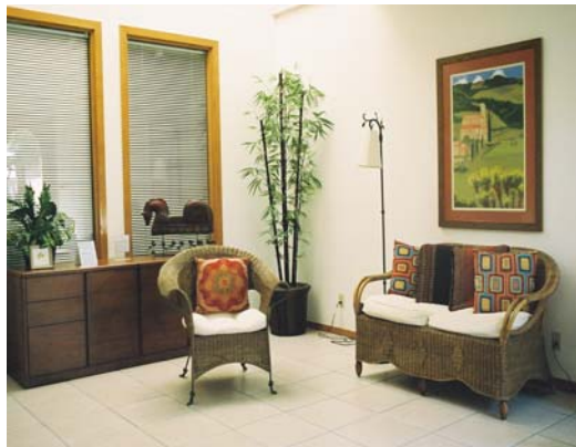
Reception Room at A Healing Place

“Healing has rekindled my heart’s ability to feel hope and joy. They had been buried under layers of physical, emotional and spiritual disconnection, illness, and dis-ease.”